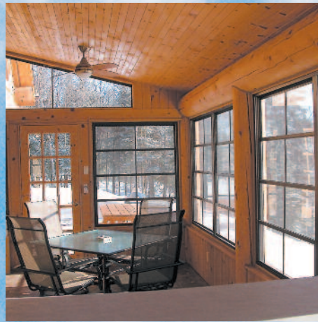
Four Vent Bronze