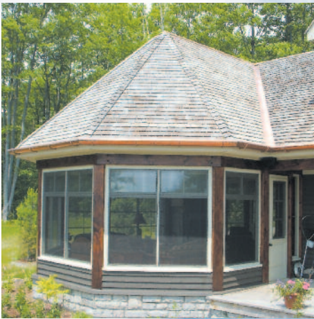
Existing Porch – 8 Vent Stereo