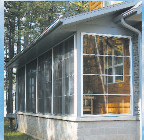
Four Vent White